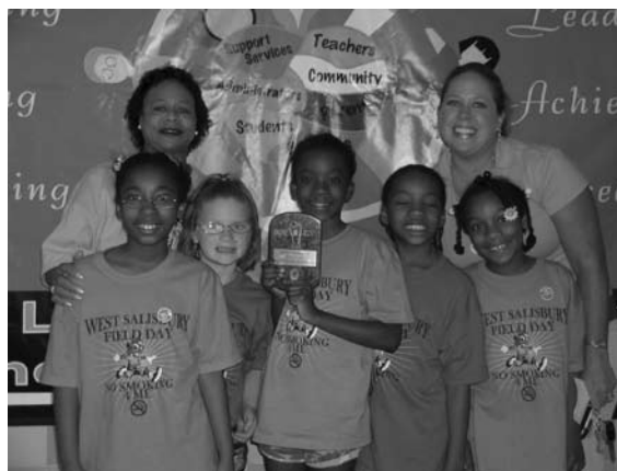
GMB's Canstruction participants.