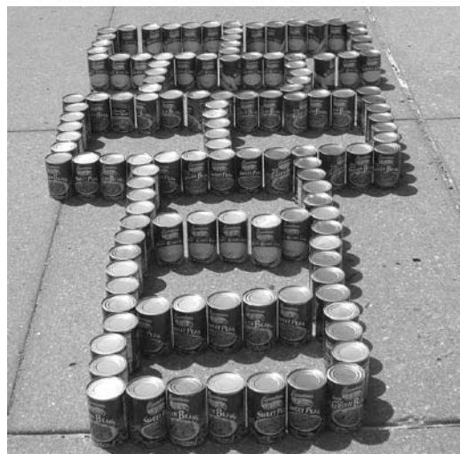
The GMB "Canstruction" project.